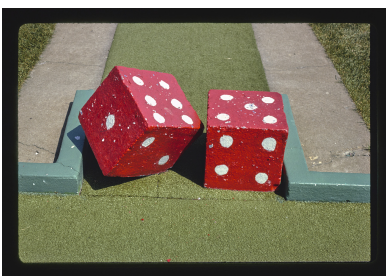
Figure 2.2

Meanwhile Clerval occupied himself, so to speak, with the moral relations of things. The busy stage of life, the virtues of heroes, and the actions of men were his theme; and his hope and his dream was to become one among those whose names are recorded in story as the gallant and adventurous benefactors of our species. The saintly soul of Elizabeth shone like a shrine-dedicated lamp in our peaceful home. Her sympathy was ours; her smile, her soft voice, the sweet glance of her celestial eyes, were ever there to bless and animate us. She was the living spirit of love to soften and attract; I might have become sullen in my study, rough through the ardour of my nature, but that