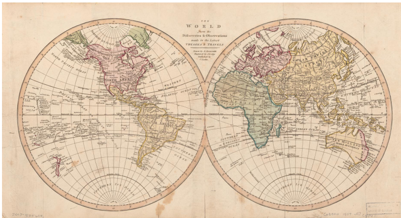
Figure 1.1: Aaron Arrowsmith (1750–1823), “The world from the discoveries & observations made in the latest voyages & travels,” London, [1807?], https://hdl.loc.gov/loc.gmd/g3200.ct009331

I am by birth a Genevese, and my family is one of the most distinguished of that republic. My ancestors had been for many years counsellors and syndics, and my father had filled several public situations with honour and reputation. He was respected by all who knew him for his integrity and indefatigable attention to public business. He passed his younger days perpetually occupied by the affairs of his country; a variety of circumstances had prevented his marrying early, nor was it until the decline of life that he became a husband and the father of a family. See Figure 1.1.